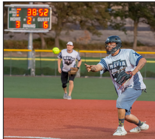
Adult slowpitch softball participation set all-time records despite the pandemic.

All but one of the scheduled youth fastpitch tournaments were canceled due to shut-