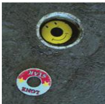
5 Points Smiley