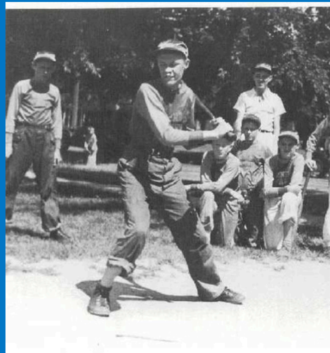
MSCR Softball, 1946